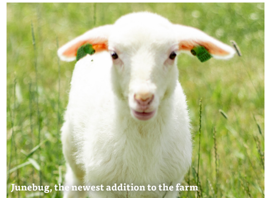
Junebug, the newest addition to the farm